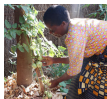
Omwe akulimira tomato