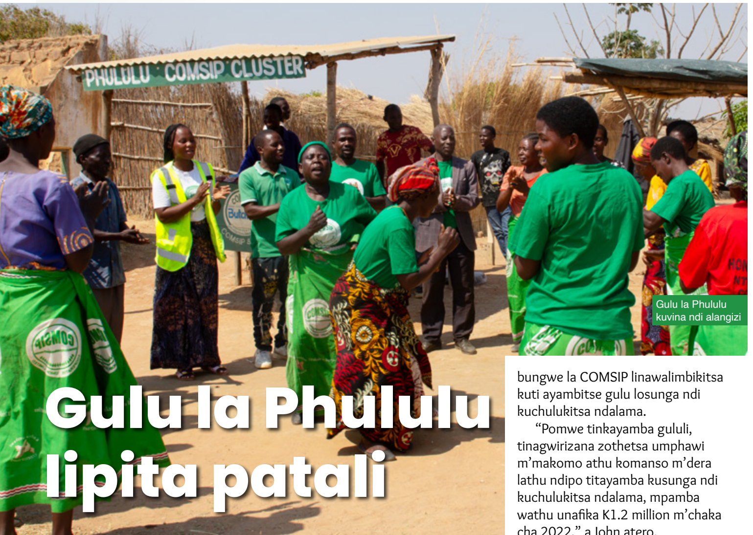
Gulu la Phululu kuvina ndi alangizi