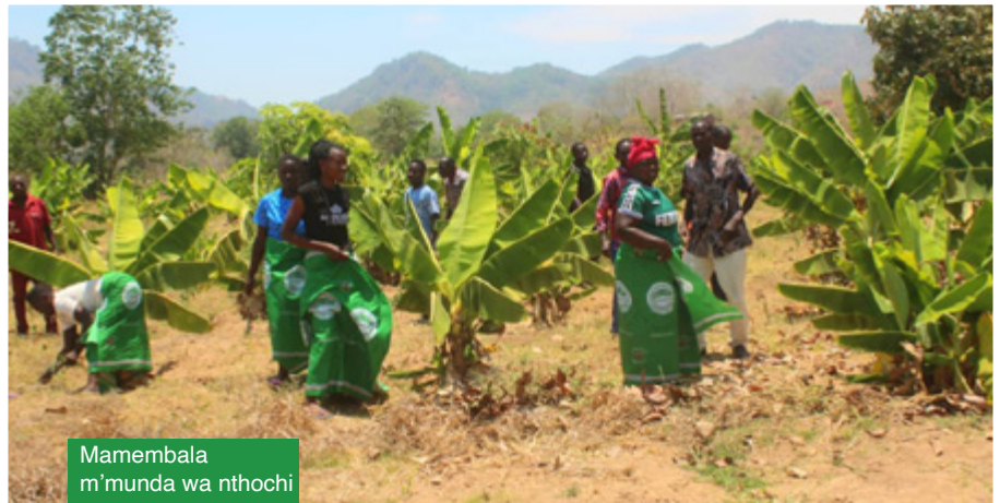
Mamembala m'munda wa nthochi