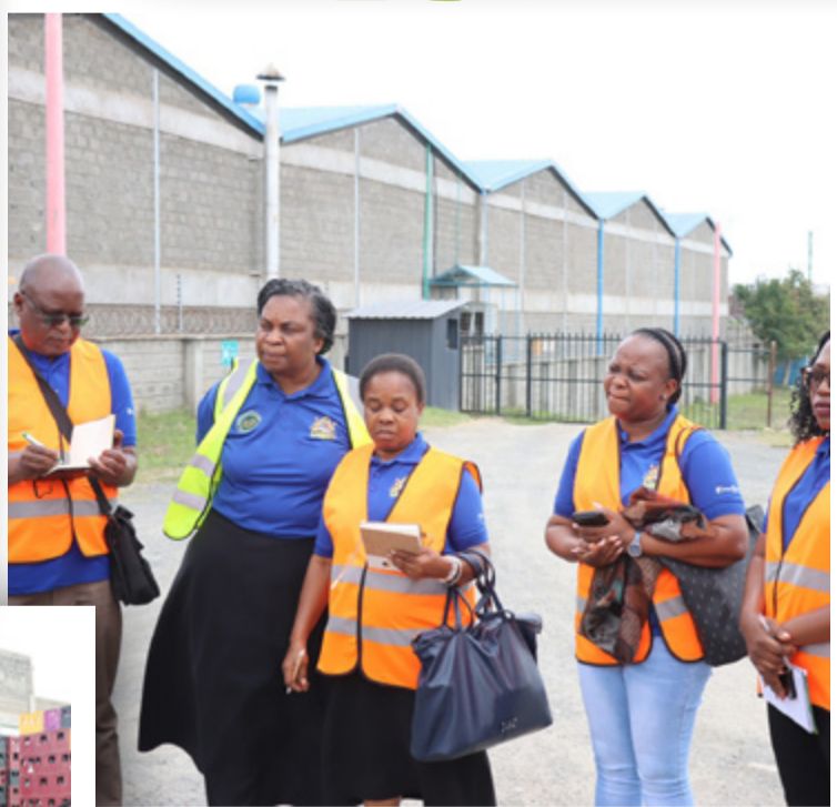
Nthumwizi zinakafika ku kampani ina yokonza ma botolo yomwe inapindula ndi Nyota