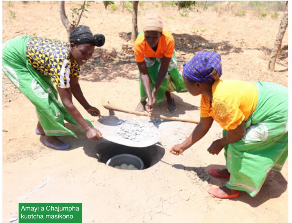
Amayi a Chajumphu kuotcha masikono

M'chaka cha 2024, kulimbikira kwawo kunapindula chifukwa anachita mwayi opindula nawo mundondomeko ya LESP pomwe anasonkha ndalama yokwana K534,000 ngati chikole ndi kulandira