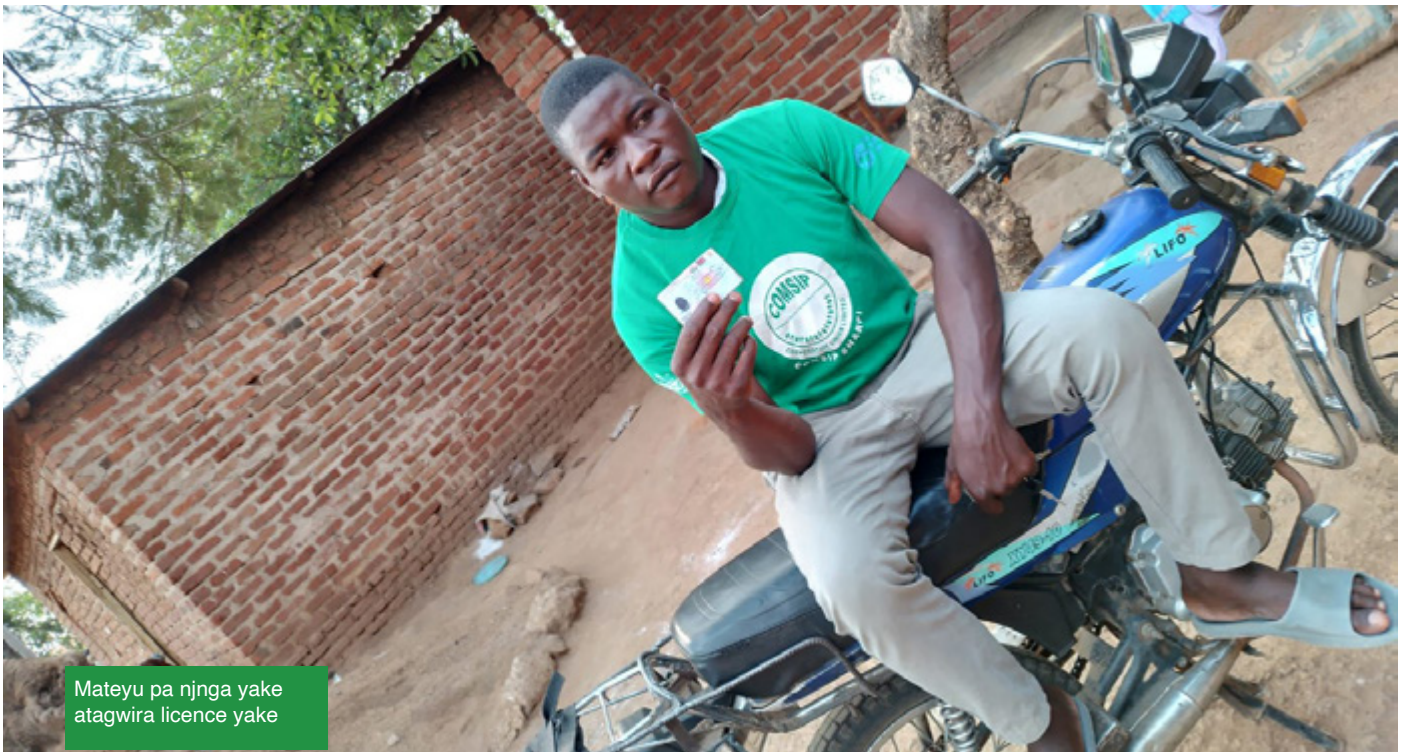
Mateyu pa njinga yake atagwira licence yake