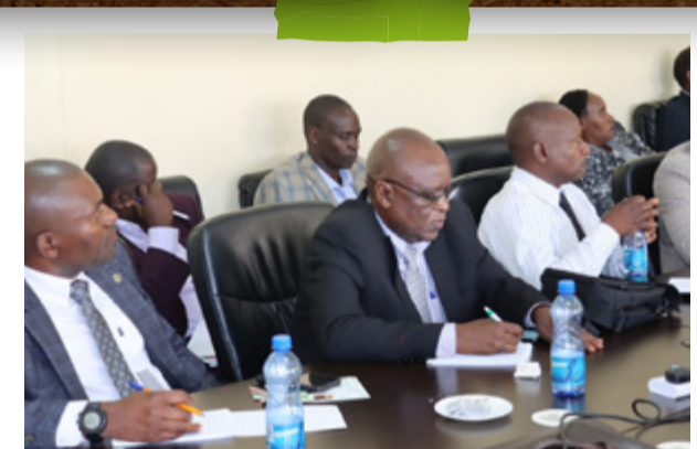
Nthumwi zochokera ku Malawi mkati mwa zokambirana