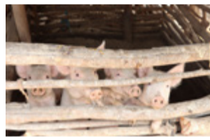
Maanja akulimbikitsidwa kuweta ziweto