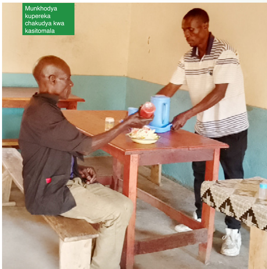
Munkhondya kupereka chakudya kwa kasitomala

“Kudzera mu COMSIP, mamembala amanga nyumba komanso kuyambitsa mabizinezi osiyanasiyana, ena akupita ngakhale kunja kukapikula ndi kugulitsa katundu, ena atsekula malo odyera, pomwe ena akuchita ulimi, mwazina,” iwo anafotokoza motero.