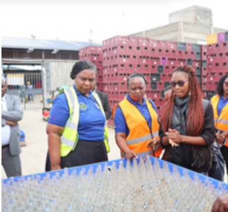
Nthumwi kuona mmene ntchito yokonza mabotolo imayendera.