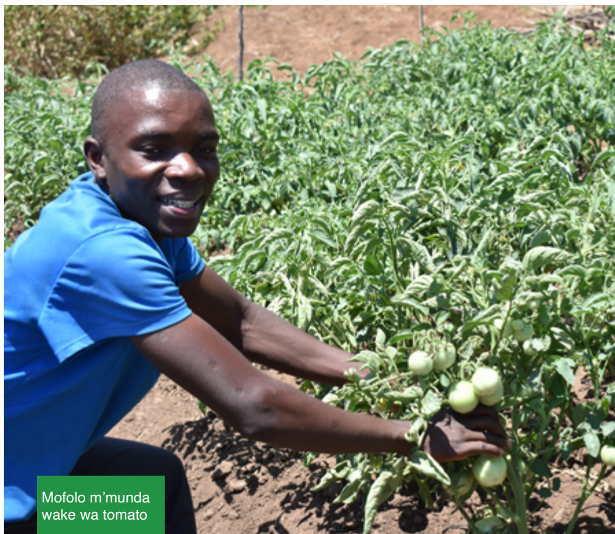
Mofolo m'munda wake wa tomato