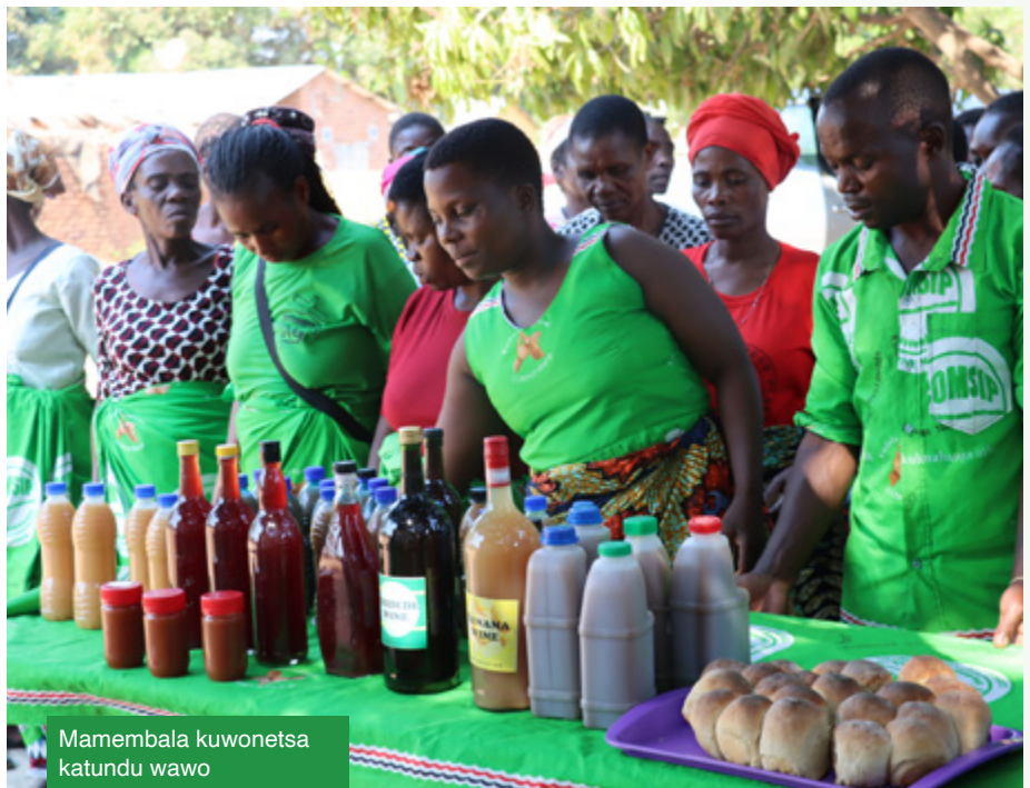
Mamembala kuwonetsa katundu wawo

zitatatu zomwe amapangira bizinesi yakabaza, wamanga nyumba, komanso akukwanitsa kulipira sukulu ana ake popanda chovuta.