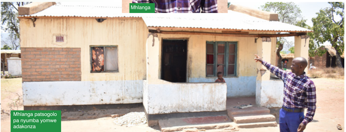
Mhlanga patsogolo pa nyumba yomwe adakonzanso