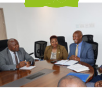
Ulendowu unayamba ku Unduna wa zachinyamata mdzikoli

Pa tsambali, zina mwa zithunzi zomwe zinatoledwa pa ulendowu.