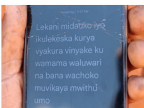
Mu pulojekitiyi ma membala amalandilanso ma uthenga a pa phone owakumbutsa zomwe anaphunzira