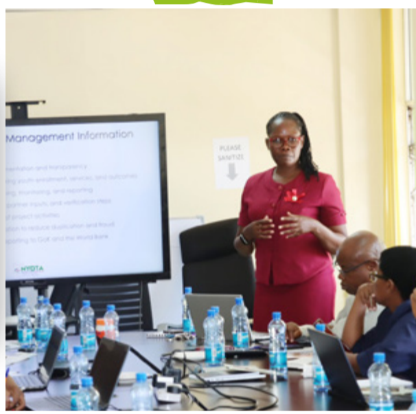
Mmodzi mwa akuluakulu a Nyota kufotokozera za pulojekiti yawo