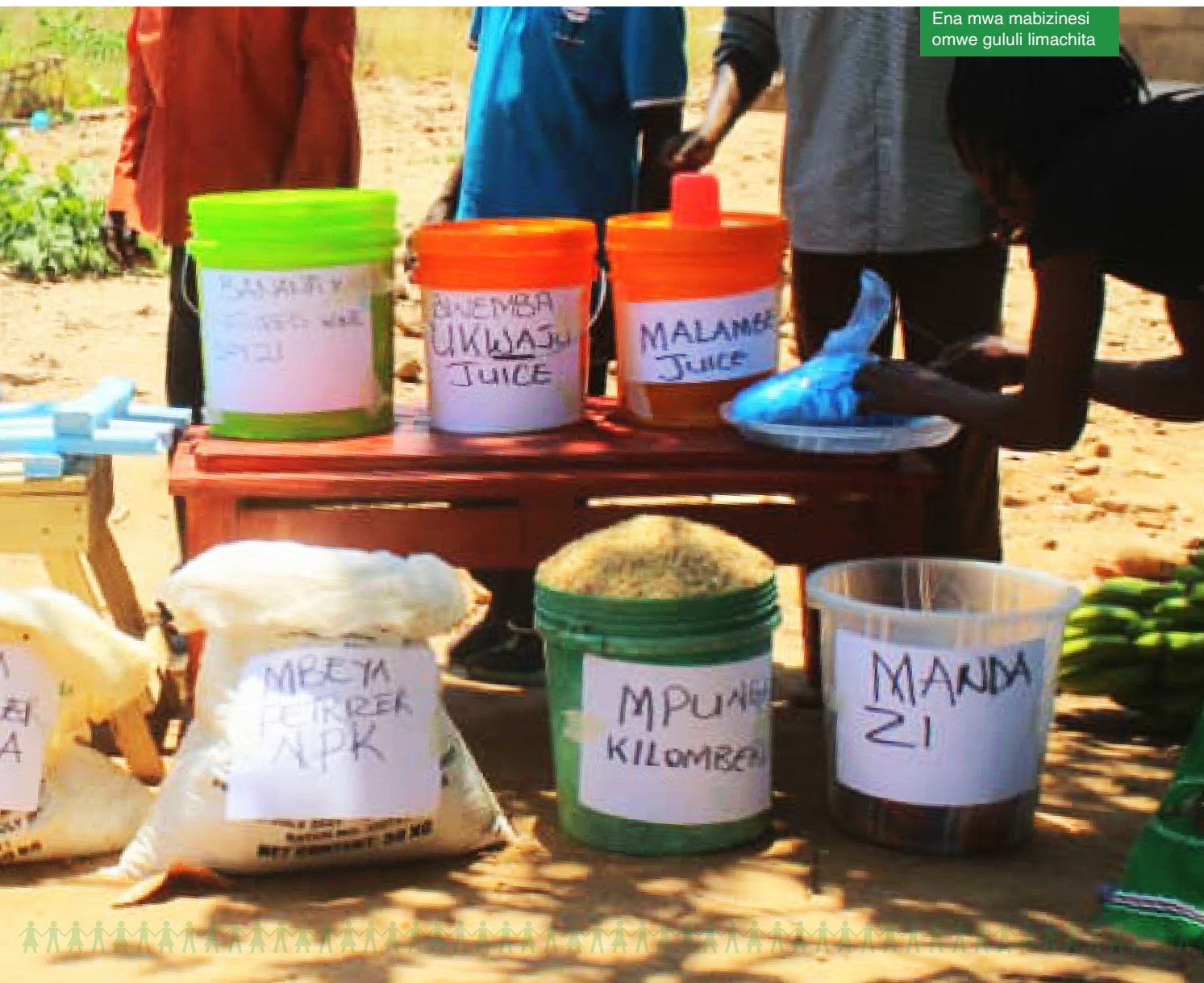
Ena mwa mabizinesi omwe gululi limachita

“Magulu onse a COMSIP anaphunzitsidwa kusunga ndalama, momwe angagwiritsire ntchito ndalama zawo komanso kuchita mabizinezi osiyanasiyana. Gulu la Kapembe laonetsa kuti ndi upangiri oyenera, madera atha kuyamba kuzidalira pawokha,” iwo anatero.