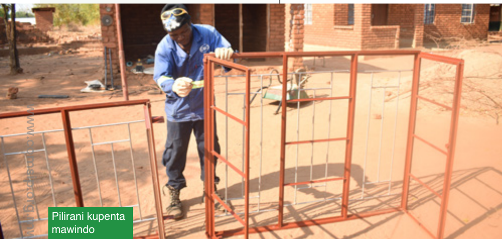
Pilirani kupenta mawindo