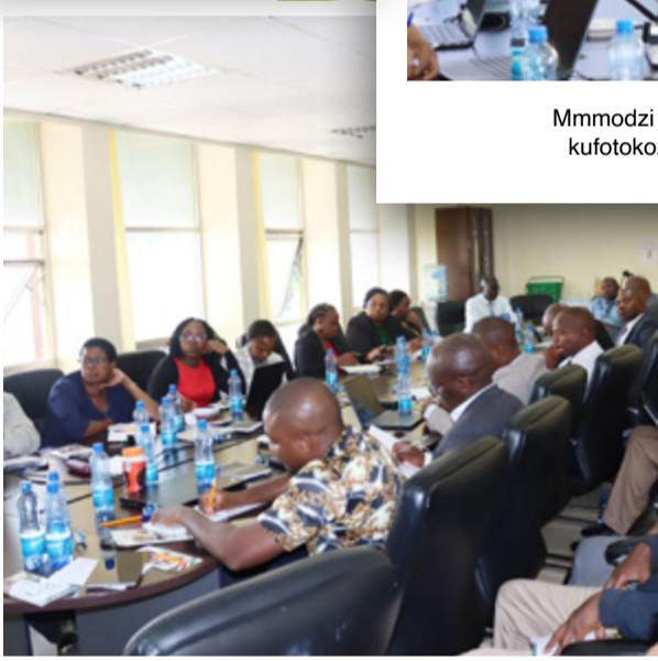
Zokambilana zili mkati ku bungwe la Nyota