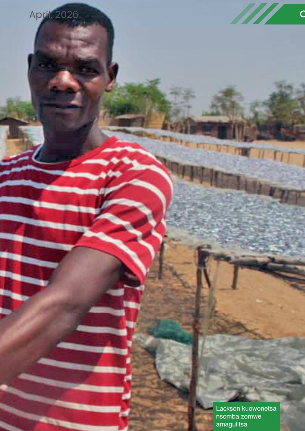
Lackson kuwonetsa nsomba zomwe amagulitsa

“Poyamba ndinalima mbatata yomwe nditagulitsa, ndinapezapo phindu la K60,000. Ndinabwerekanso K50,000 kugulu ndikuyamba kugula komanso kugulitsa nsomba, mpunga ndi nyemba,”