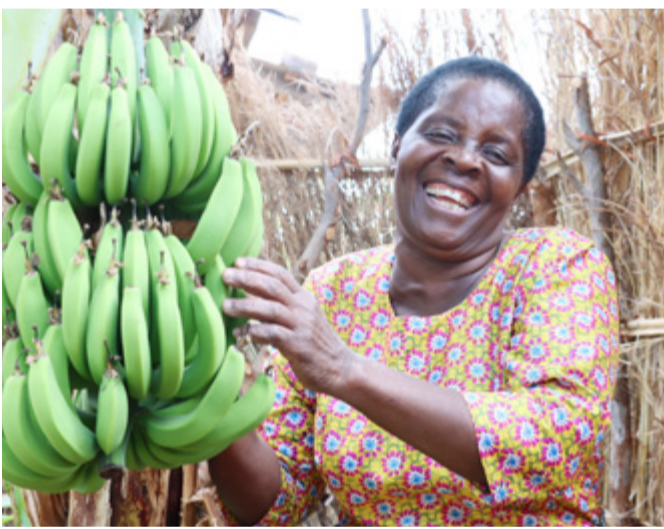
Alinso ndi nthochi