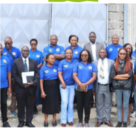
Chithuzi cha gulu cha a ku Kenya ndi a ku Malawi