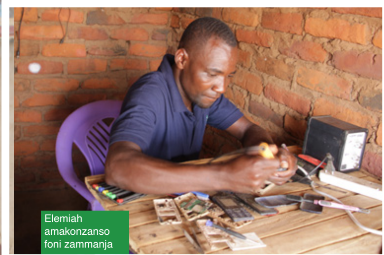
Elemiah amakonzanso foni zammanja