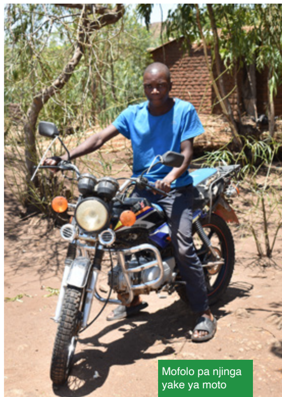
Mofolo pa njinga yake ya moto