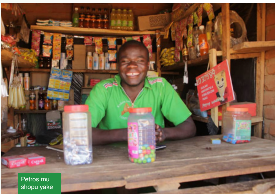
Petros mu shopu yake