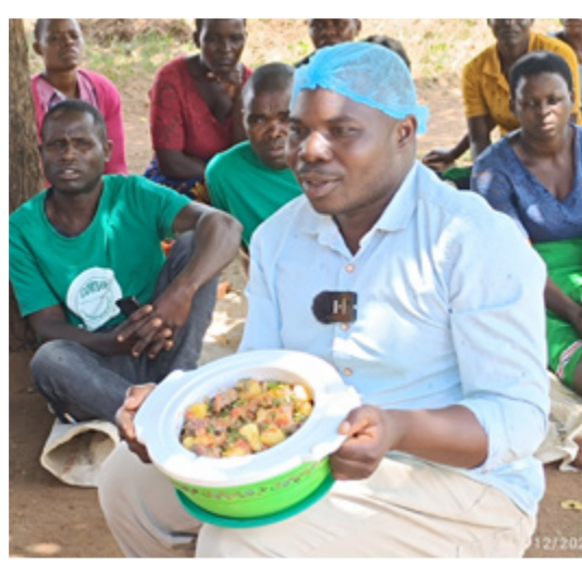
Mlangizi wa ku dera ku Mkukula A ku Dowa kuonetsa zina mwa zakudya zomwe anaphunzira kuphika mu pulojekitiyi