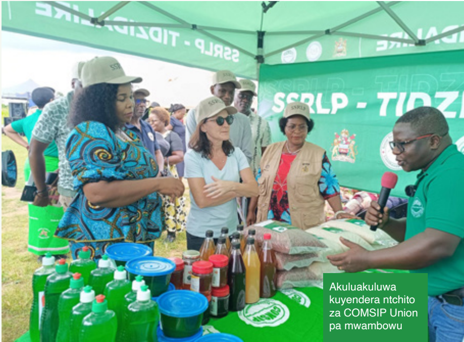
Akuluakuluwa kuyendera ntchito za COMSIP Union pa mwambowu