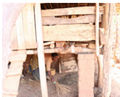
Ndi mbuzi zomwe amakolola ndowe zake