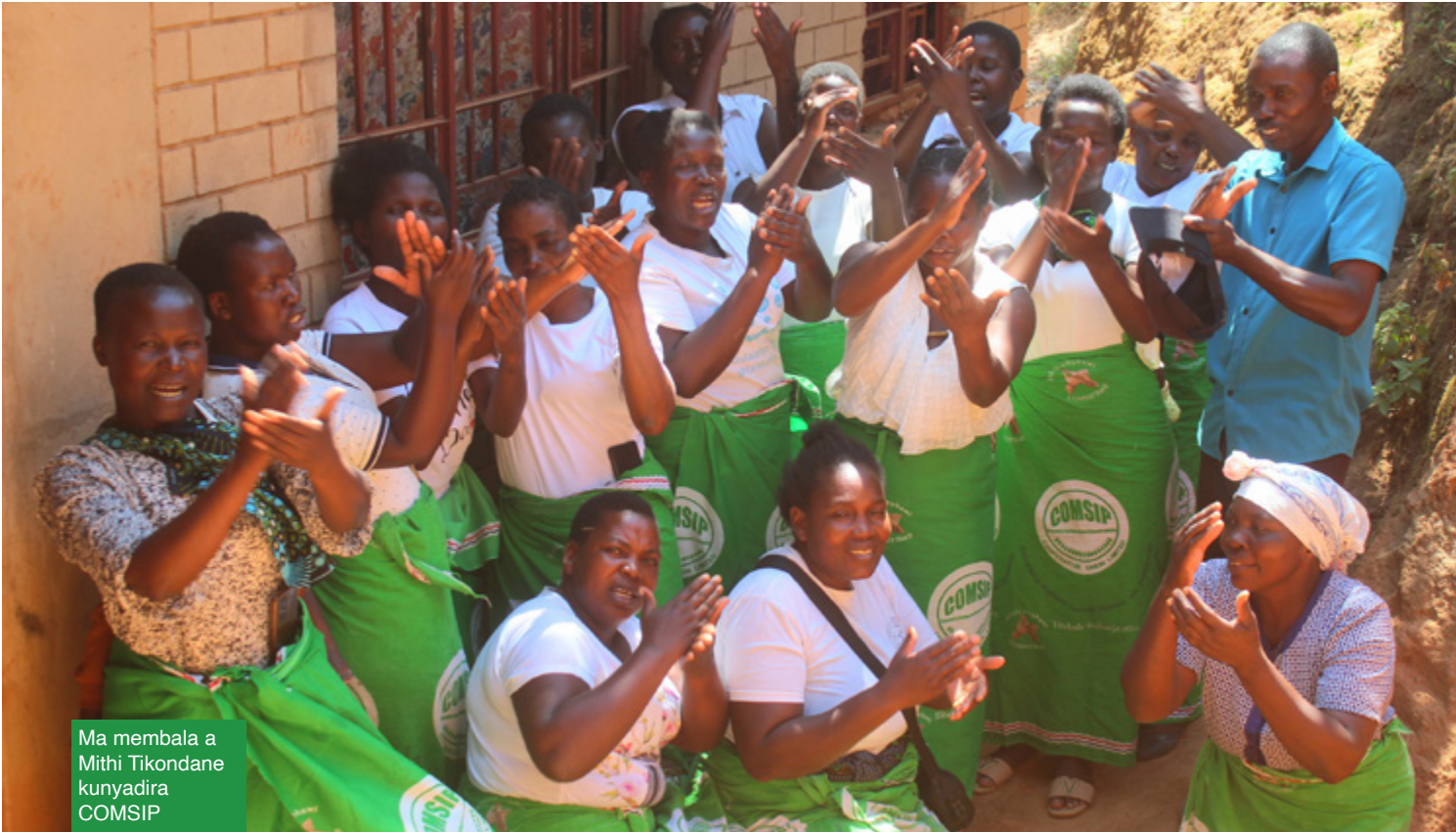
Ma membala a Mithi Tikondane kunyadira COMSIP

kayendetsedwe ka bizinezi ndi mmene tingasamalire ndalama. Maphunzirowa adatithandiza kukwaniritsa ma pulani ndi zolinga za gulu lathu.